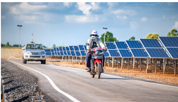
Building a Sustainable Energy Future: The Greater Mekong Subregion