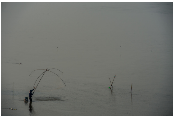
Fisherman catching fish along the banks of the Mekong River in Savannakhet, Lao PDR.