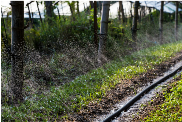
Organic vegetables being grown by farmers in Savannakhet, Lao PDR.