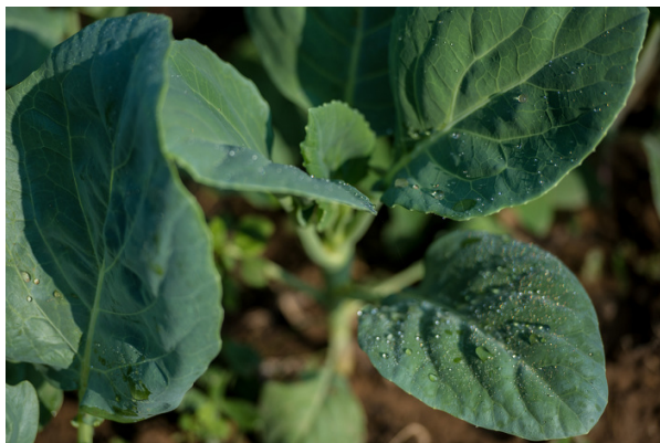
Organic vegetables being grown by farmers in Savannakhet, Lao PDR.