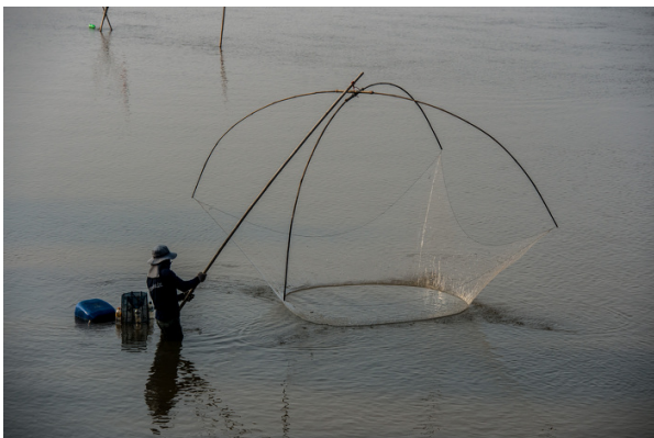
Fisherman catching fish along the banks of the Mekong River in Savannakhet, Lao PDR.