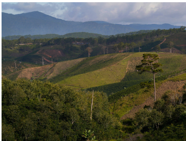
The sustainably managed biodiversity corridors in Cambodia, the Lao PDR, and Viet Nam.