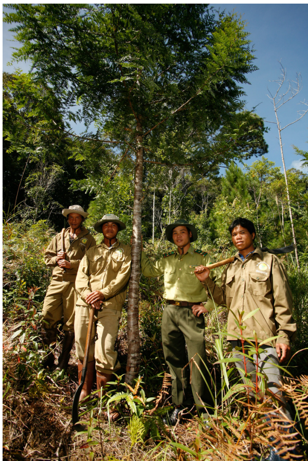
Forest rangers pose beside a replanted pine tree in Da Chais commune. Conservation, protection and police work comprises the work of these individuals.