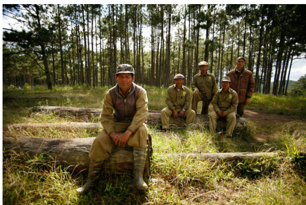
Kânhô villagers from the Da Chais commune prepare to go out on patrol in Da Nhim.