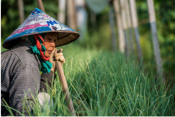
Farmer of organic vegetables along the economic corridors.