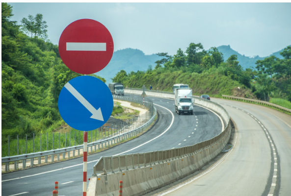
The 244-kilometer Noi Bai-Lao Cai Highway starts at Noi Bai in a suburb of Hanoi and ends at Lao Cai, on the border with the People's Republic of China (PRC) in northwest Viet Nam. The Noi Bai-Lao Cai Highway is an integral section of the eastern link of the Greater Mekong Subregion (GMS) Northern Economic Corridor, connecting Kunming in Yunnan province of the PRC with Hanoi, and Hai Phong and Cai Lan ports in Viet Nam. The highway decreased the cost of travel, which encouraged economic activities in the project area and employment opportunities for the local population, and improved access to social services.