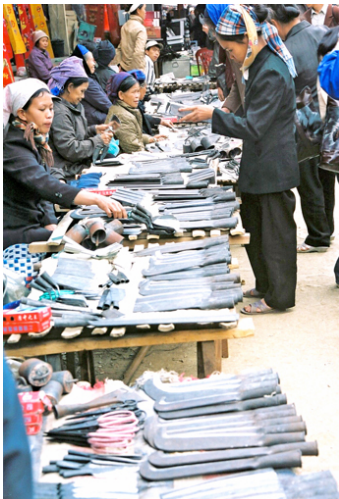
The tourism-related local microenterprises and communities.