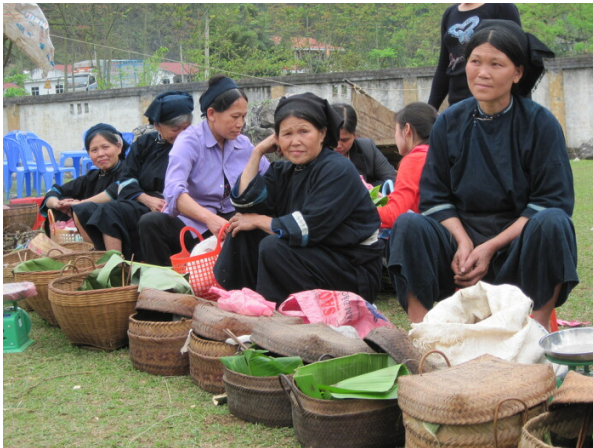
The tourism-related local microenterprises and communities.