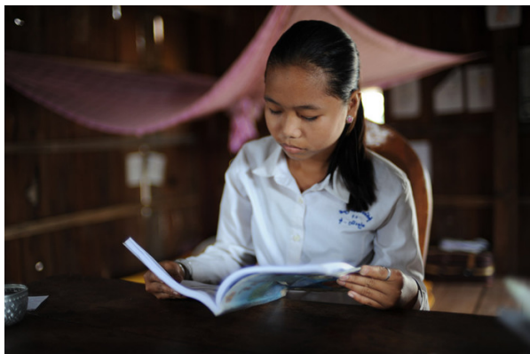
She says she hopes to become a doctor someday.

Source: http://www.adb.org/news/photo-essays/moving-better-lives-cambodia