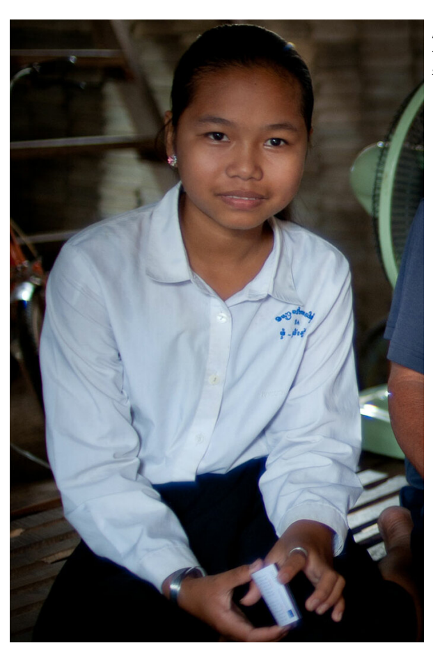
A happy 12-year-old girl relocated because of the railway project.