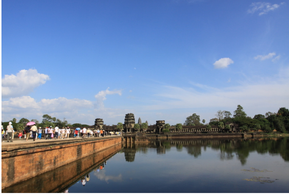
Tourist visitors at Angkor Wat.