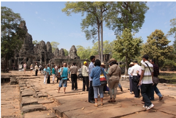
Tourism-related local microenterprises and communities.