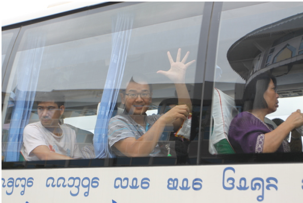
Tourist visitors at Angkor Wat.