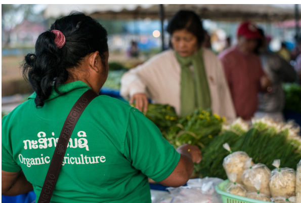
Farmers selling their organically grown vegetables.