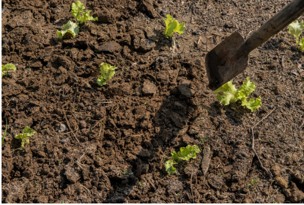
Organic vegetables along the economic corridors.