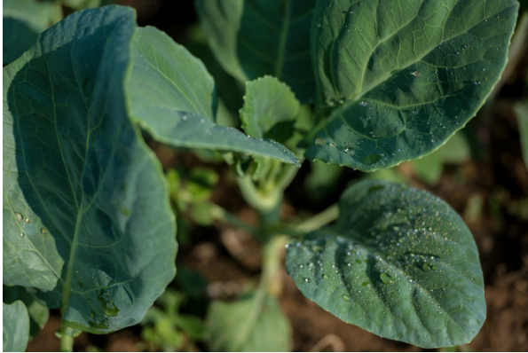
Organic vegetables along the economic corridors.