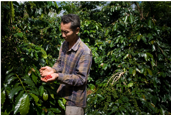
Coffee plantation is an alternative source of income and environmentally-friendly in preservation of national parks.