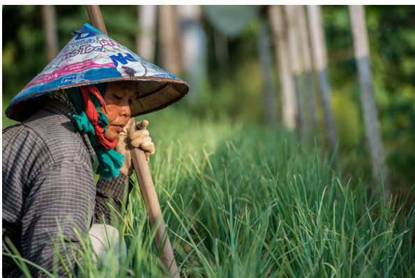
Organic vegetables along the economic corridors.