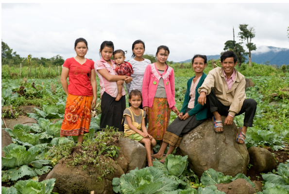
A happy family of farmers of organic vegetables along the economic corridors.