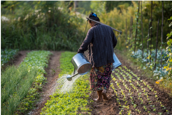
Farmer of organic vegetables along the economic corridors.