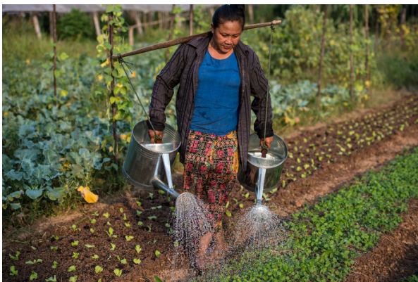
Farmer of organic vegetables along the economic corridors.