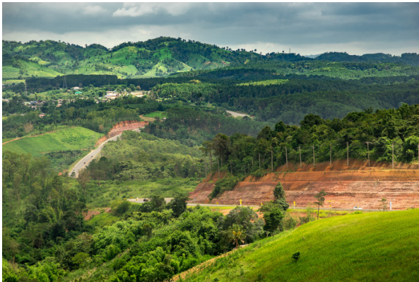
Highway 12 from Phitsanulok to Lom Sak, Thailand (105 km) is on the GMS East-West Economic Corridor.