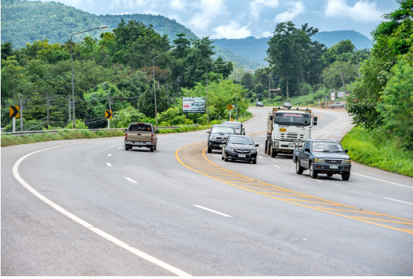
Private vehicles and a delivery truck passing through Highway 12. Highway 12 from Phitsanulok to Lom Sak, Thailand (105 km) is on the GMS East-West Economic Corridor.