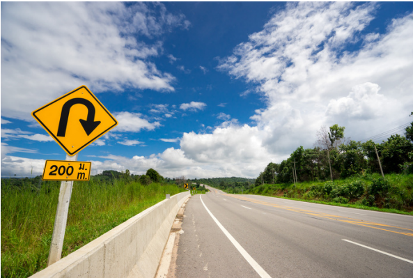
Highway 12 from Phitsanulok to Lom Sak, Thailand (105 km) is on the GMS East-West Economic Corridor.