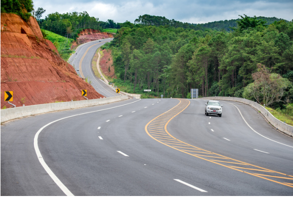
Highway 12 from Phitsanulok to Lom Sak, Thailand (105 km) is on the GMS East-West Economic Corridor.