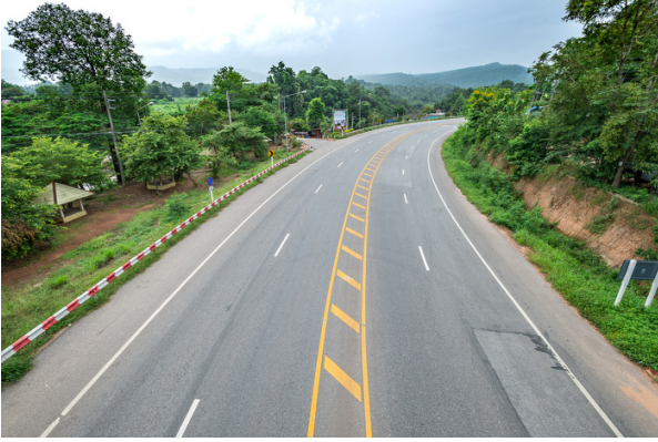
Highway 12 from Phitsanulok to Lom Sak, Thailand (105 km) is on the GMS East-West Economic Corridor.