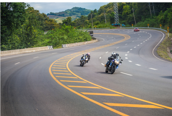
Highway 12 from Phitsanulok to Lom Sak, Thailand (105 km) is on the GMS East-West Economic Corridor.