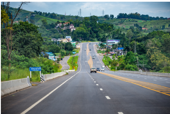
Highway 12 from Phitsanulok to Lom Sak, Thailand (105 km) is on the GMS East-West Economic Corridor.