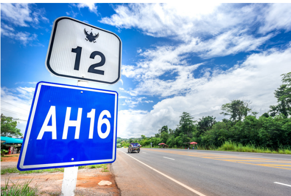
Road sign at AH 16 in Phetchabun province. Asian Highway 16 (AH16) is a road in the Asian Highway Network running 1,031 kilometres (641 mi) from Tak, Thailand to Hanoi, Vietnam