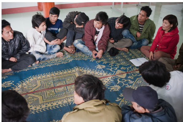
Young people learning about health and sexual behavior during a group discussion at Vung Kho Village, Dakrong Commune, Dakrong District, Quang Tri Province, Viet Nam.