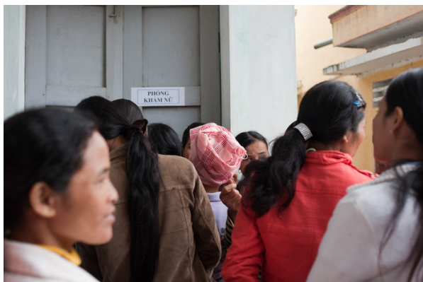
Patients waiting for consultation at the Mobile Sexually Transmitted Infections Clinic in Dakrong District, Quang Tri Province, Viet Nam.