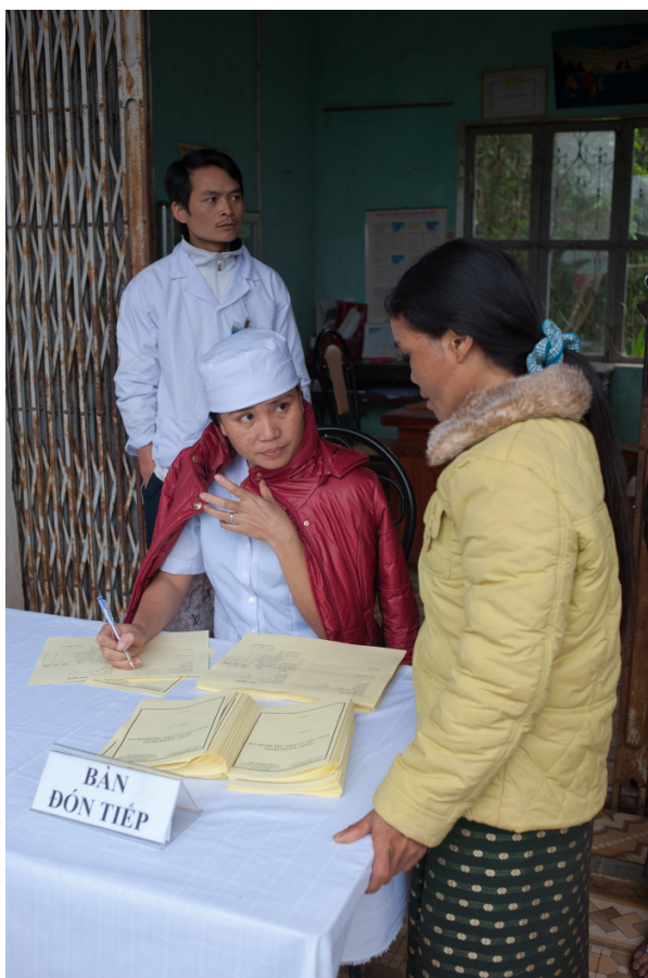
Woman is being interviewed for her medical history at the Mobile Sexually Transmitted Infections Clinic in Dakrong District, Quang Tri Province, Viet Nam.