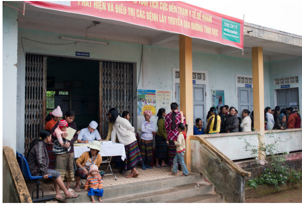
Patients waiting for consultation at the Mobile Sexually Transmitted Infections Clinic in Dakrong District, Quang Tri Province, Viet Nam.