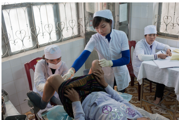
Patient undergo a check up at the Mobile Sexually Transmitted Infections Clinic in Dakrong District, Quang Tri Province, Viet Nam.