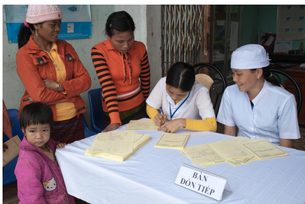
Patients waiting for consultation at the Mobile Sexually Transmitted Infections Clinic in Dakrong District, Quang Tri Province, Viet Nam.