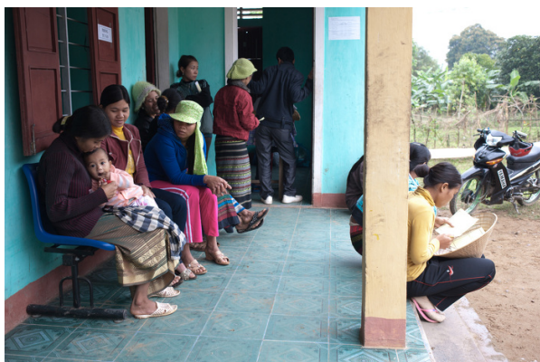
Patients waiting for consultation at the Mobile Sexually Transmitted Infections Clinic in Dakrong District, Quang Tri Province, Viet Nam.