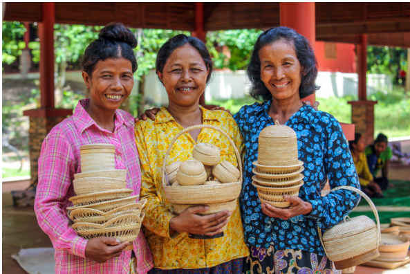
Handicrafts producer group located in the Chrames village, Sambor commune, Prasat Sambor district, Kampong Thom province. The group is a beneficiary of an ADB-supported project to improve livelihoods by creating jobs for local people in Kampong Thom, Cambodia.