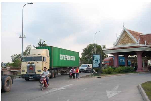
The Bavet Checkpoint of Phnom Penh - Ho Chi Minh City Highway in Cambodia.