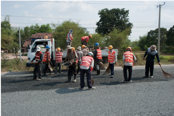
Workers of Route 1 in between Bavet and Phnom Penh.