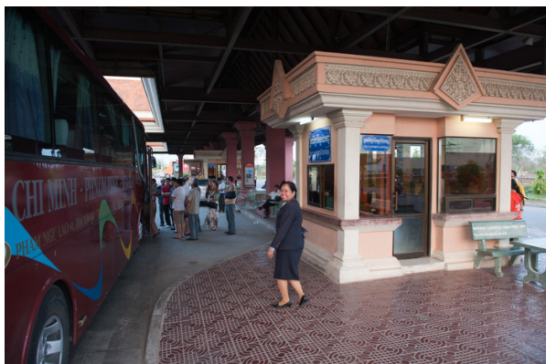
The Bavet Checkpoint of Phnom Penh - Ho Chi Minh City Highway in Cambodia.