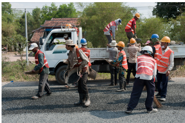
Workers of Route 1 in between Bavet and Phnom Penh.