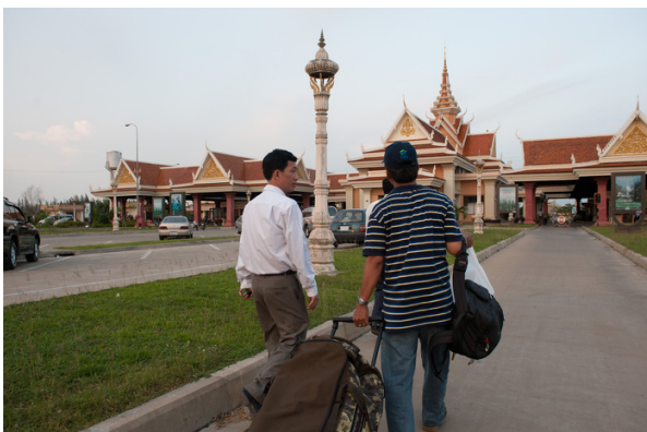
The Bavet Checkpoint of Phnom Penh - Ho Chi Minh City Highway in Cambodia.