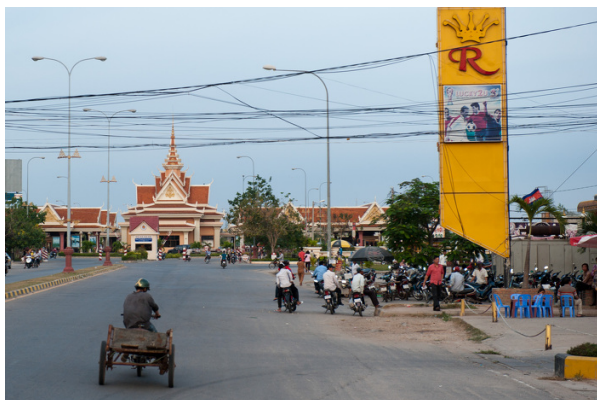
The Bavet Checkpoint of Phnom Penh - Ho Chi Minh City Highway in Cambodia.