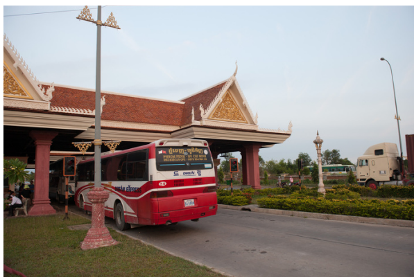
The Bavet Checkpoint of Phnom Penh - Ho Chi Minh City Highway in Cambodia.