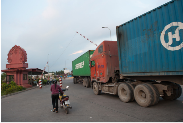
The Bavet Checkpoint of Phnom Penh - Ho Chi Minh City Highway in Cambodia.