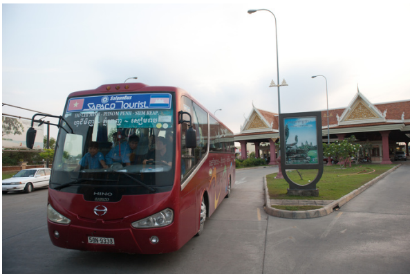
The Bavet Checkpoint of Phnom Penh - Ho Chi Minh City Highway in Cambodia.