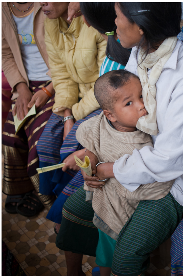
A mother brings her child for medical consultation at a health center in Dakrong District, Quang Tri Province.