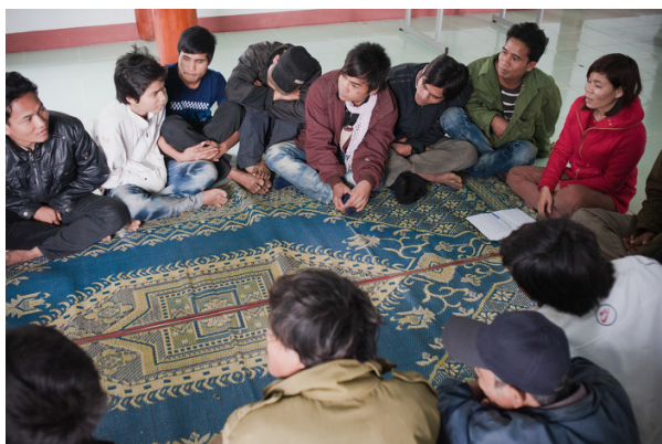
Young people listen and discuss during a DVD session to learn about health and sexual behavior, at Vung Kho Village, Dakrong Commune, Dakrong District, Quang Tri Province.