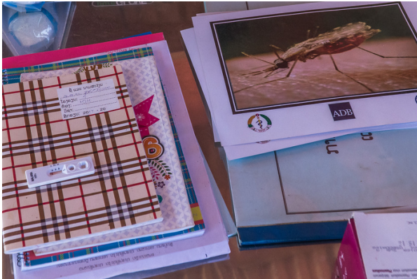
Malaria testing strip.