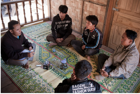
Farmers gather round the radio to listen to a program about health and sexual behavior in Bru Tribe Village, Sepone District, Savannakhet Province.