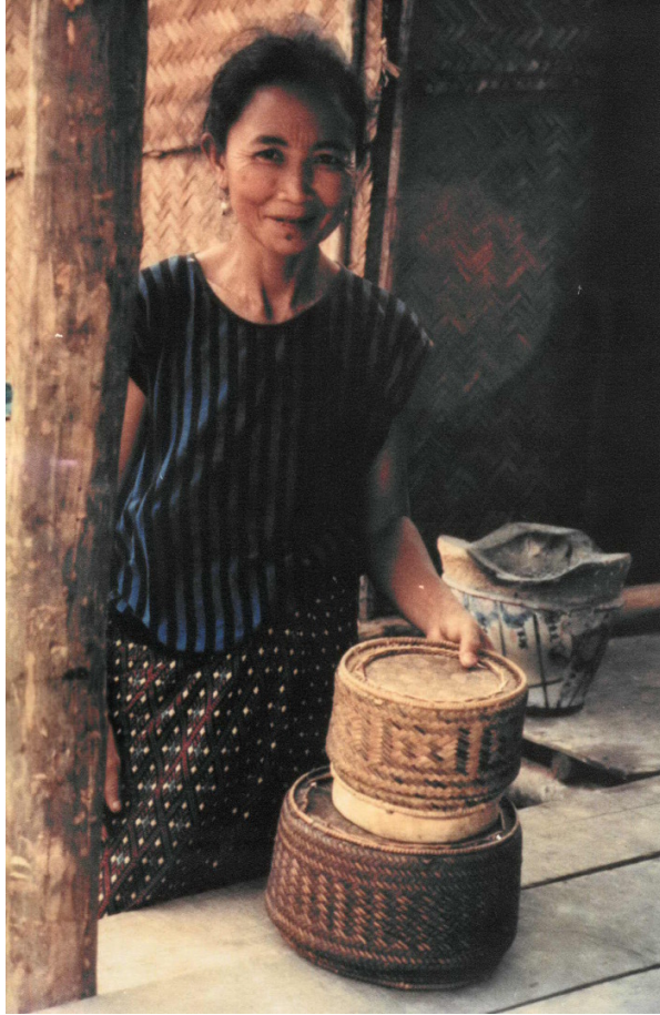
A happy villager that will be benefited on the Theun-Hinboun Hydropower Project.