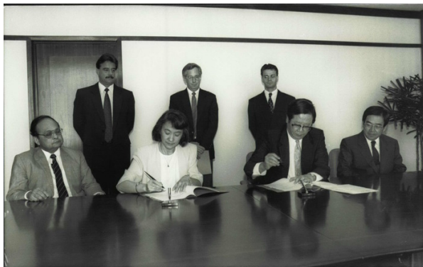
ADB and Lao PDR officials during the loan signing of the Theun-Hinboun Hydropower Project.