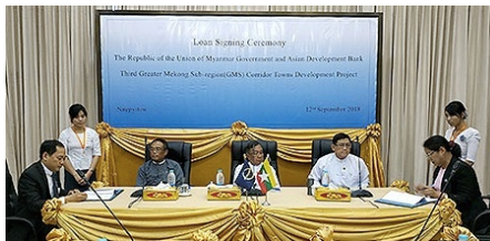
Myanmar, ADB sign agreement to develop GMS corridor towns.