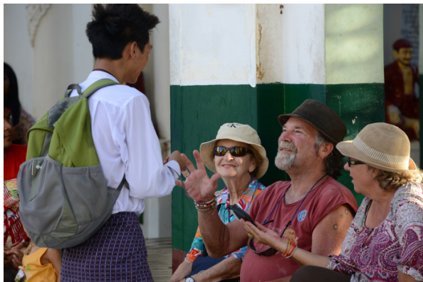
Myanmar attracts tourists because of its friendly people, rich culture and competitive prices. In 2012 the country hosted around one million foreign visitors. If Myanmar maintains political stability and high levels of growth, international visitor arrivals are forecast to rise as high as 5.14 million in 2020, with corresponding tourism receipts worth $6.9 billion.