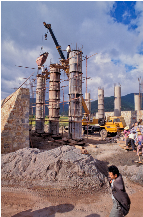
Men working at the construction site of the Yunnan Expressway in China.